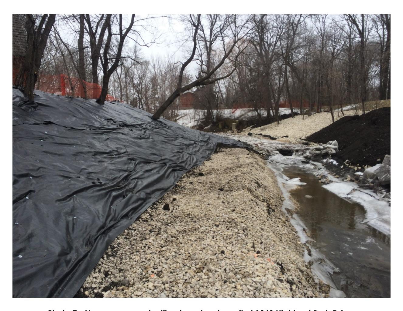
Photo 7 - Non-woven geotextile placed on topsoil at 1040 Highland Park Drive.