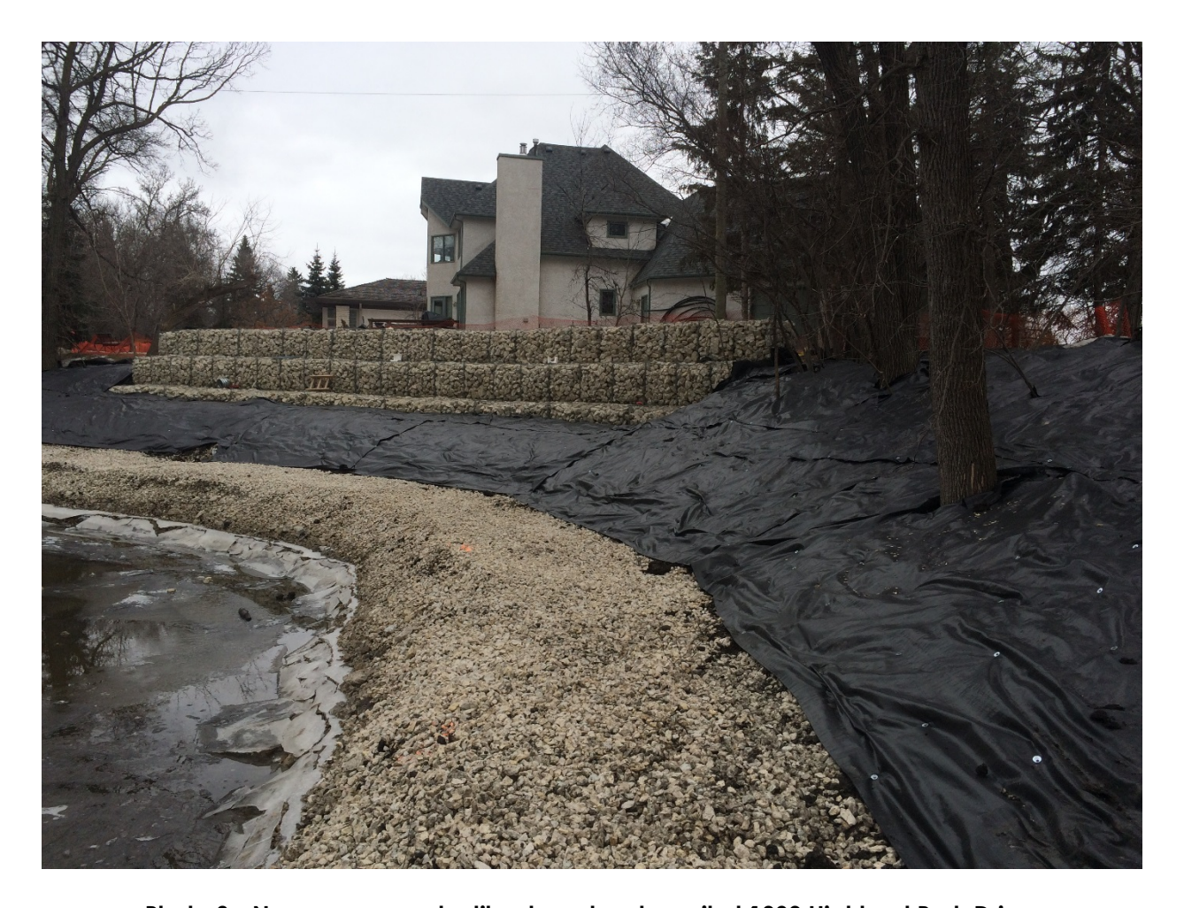
Photo 8 - Non-woven geotextile placed on topsoil at 1030 Highland Park Drive.