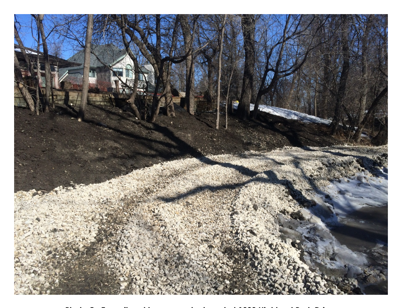
Photo 5 - Topsoil and terrace rock placed at 1020 Highland Park Drive.