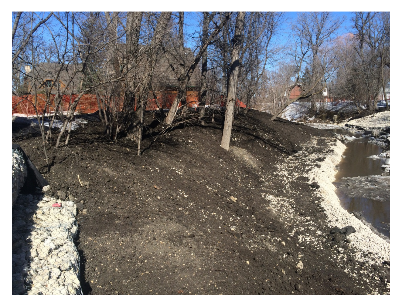
Photo 3 - Topsoil and terrace rock placed at 1040 Highland Park Drive.