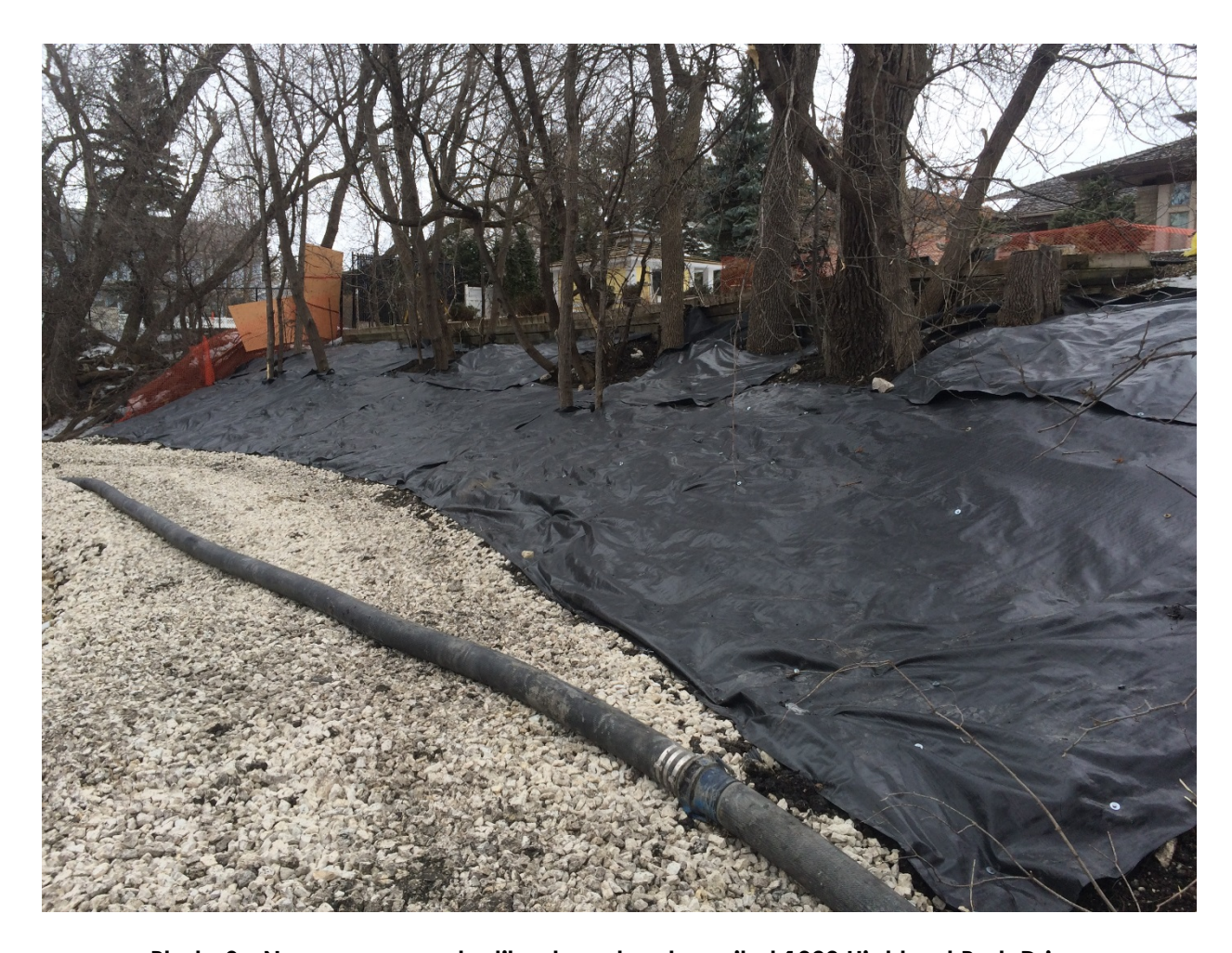
Photo 9 - Non-woven geotextile placed on topsoil at 1020 Highland Park Drive.