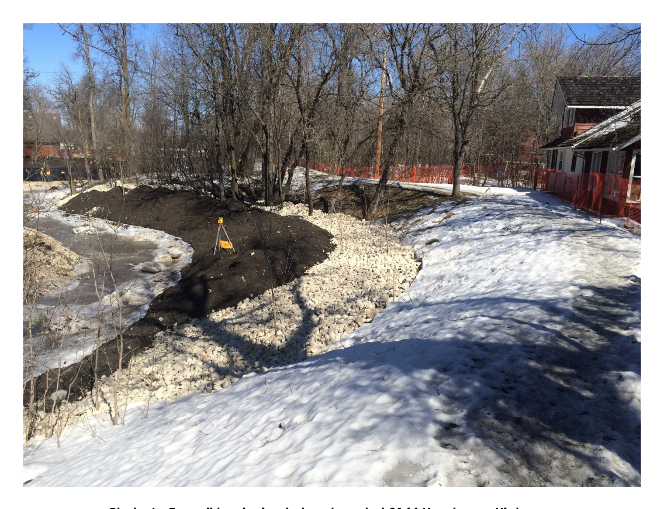
Photo 6 - Topsoil beginning to be placed at 3144 Henderson Highway.