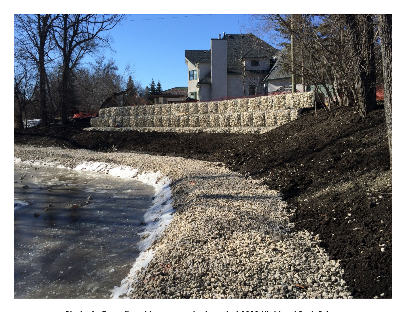
Photo 4 - Topsoil and terrace rock placed at 1030 Highland Park Drive.