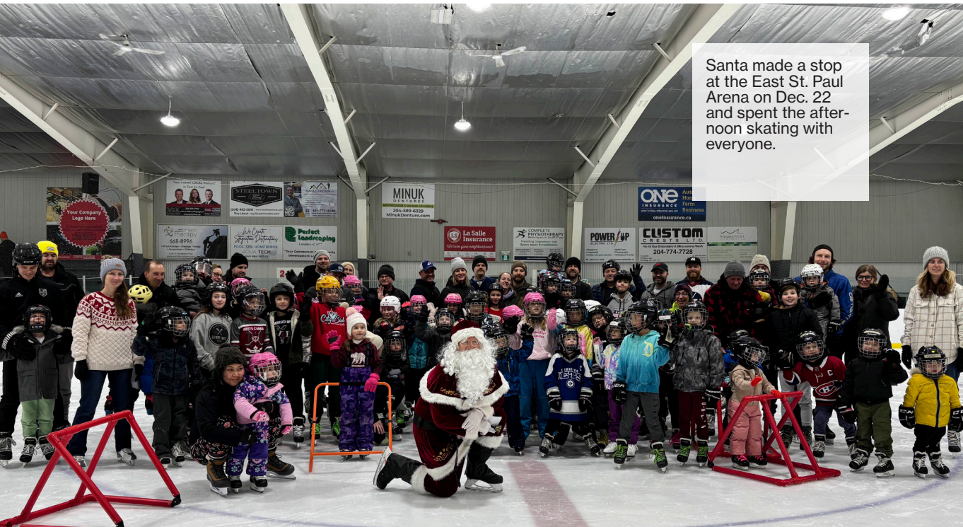
Santa made a stop at the East St. Paul Arena on Dec. 22 and spent the afternoon skating with everyone.

Starting January 1st, 2025, the Red River North RCMP will no longer be accepting cash for criminal record checks. Payment options are certified cheque or money order in the amount of $10, made out to the Receiver General for Canada.