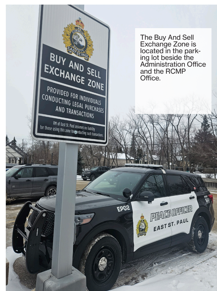
The Buy And Sell Exchange Zone is located in the parking lot beside the Administration Office and the RCMP Office.

We hope this initiative helps make your buying and selling experiences safer and more secure. Thank you for being proactive in keeping our community safe.