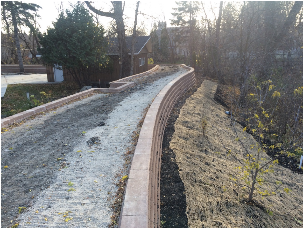
Photo 1 - Dike at 3144 Henderson Highway.