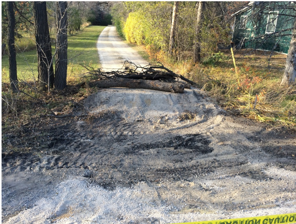
Photo 5 - Removed original driveway approach at 3144 Henderson Highway.