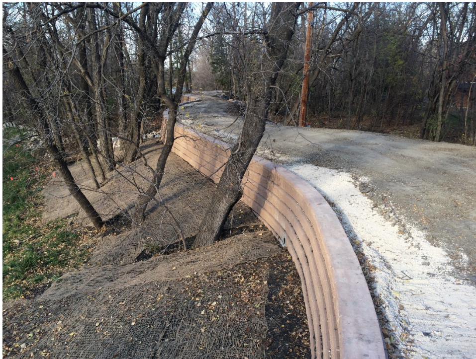
Photo 3 - Dike at 3144/3154 Henderson Highway.