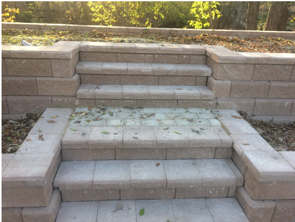
Photo 7 - Stairs at 1040 Highland Park Drive.