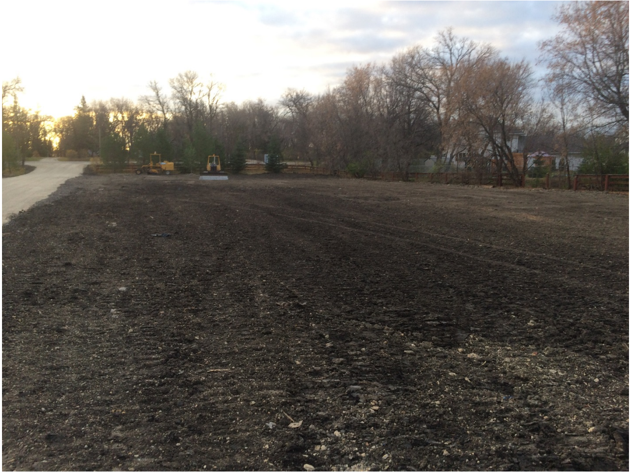
Photo 10 - Site laydown area at 3144 Henderson Highway.