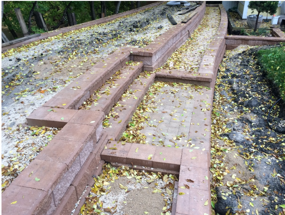
Photo 8 - Stairs at 1020 Highland Park Drive.