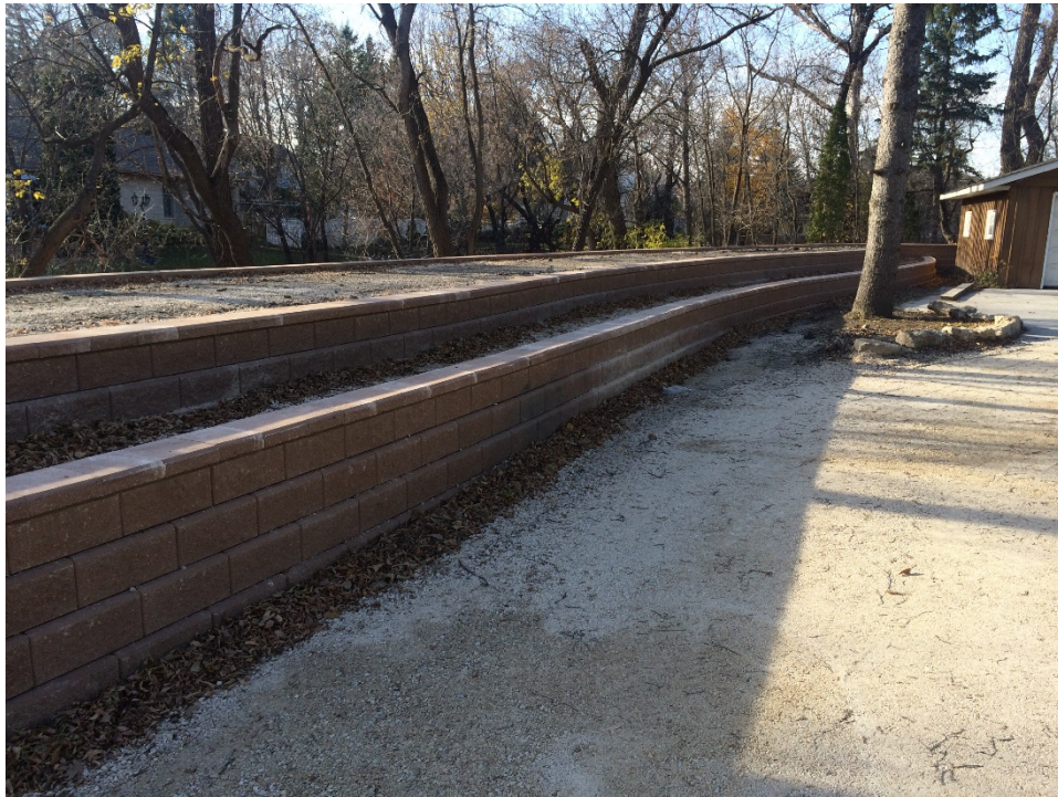
Photo 6 - Dike at 3144 Henderson Highway.