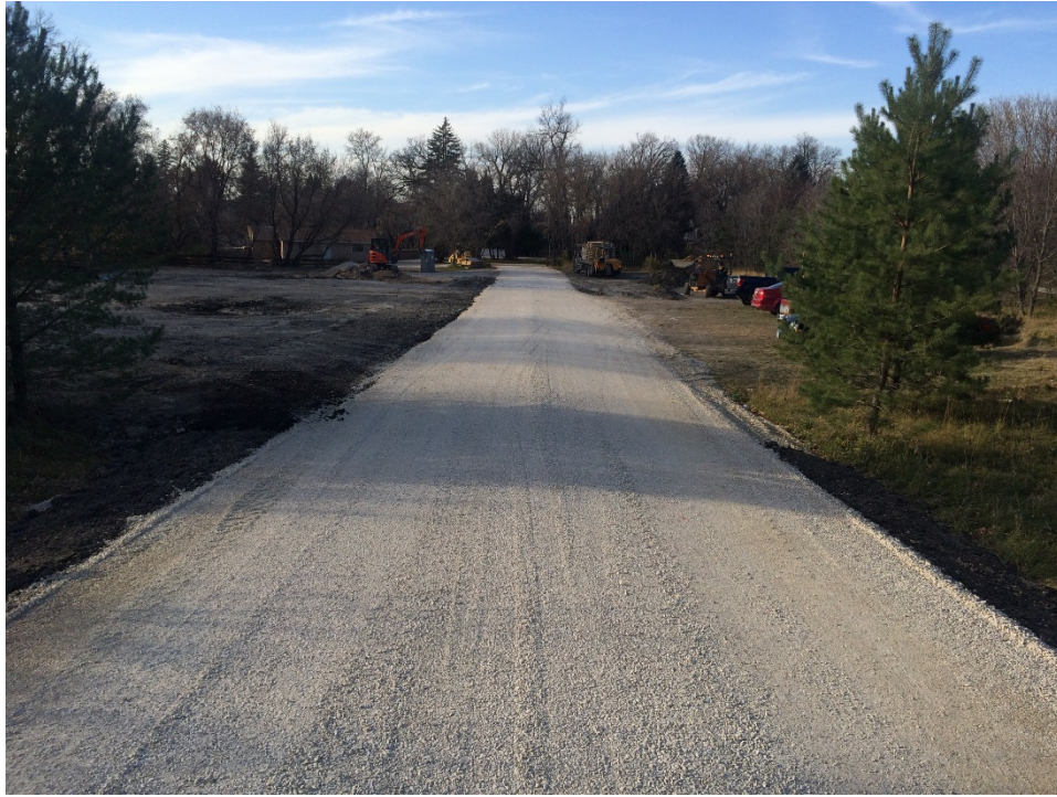
Photo 4 - Access roadway at 3144 Henderson Highway.