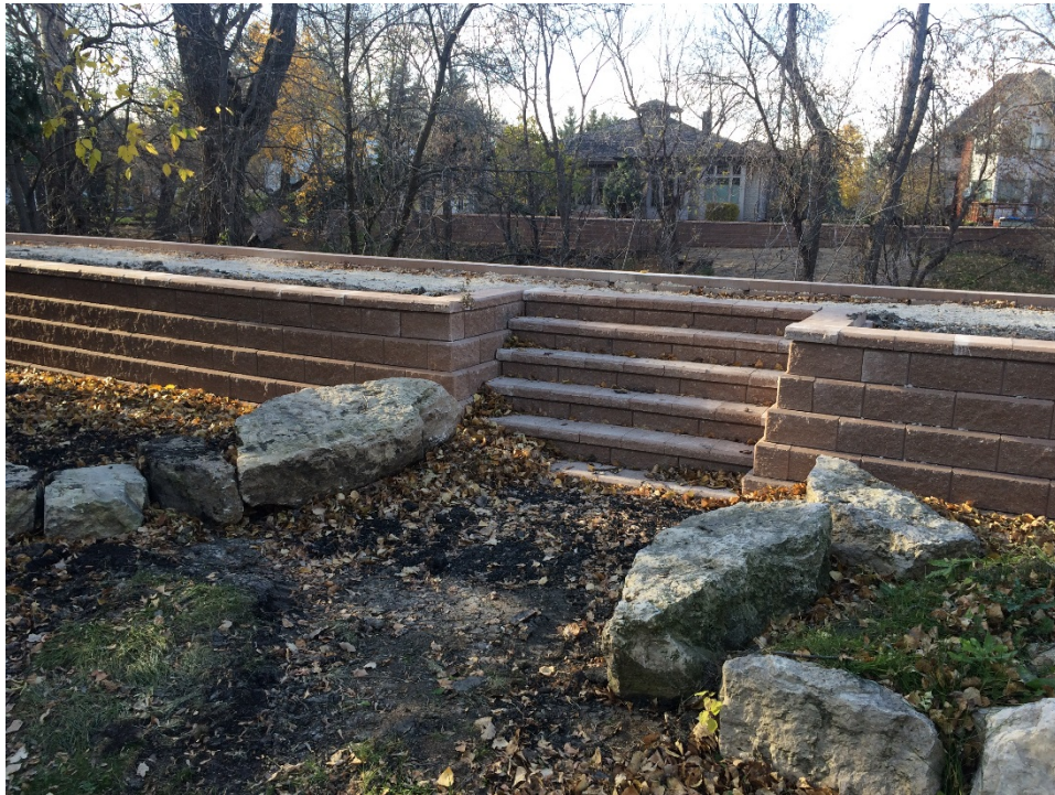
Photo 2 - Stairs at 3144 Henderson Highway.