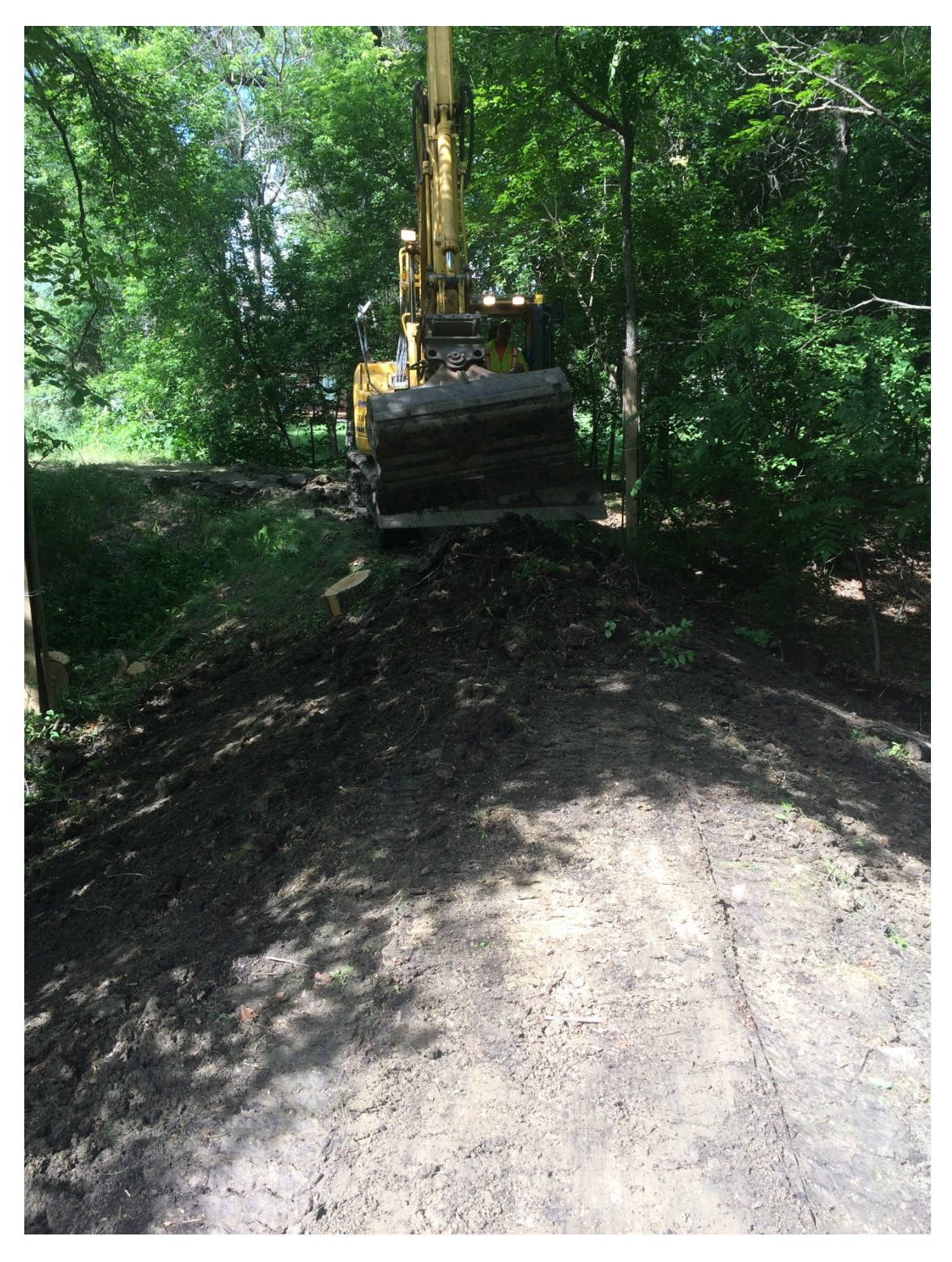
Photo 3 - Removal of organics from existing dike at 3154 Henderson Highway.