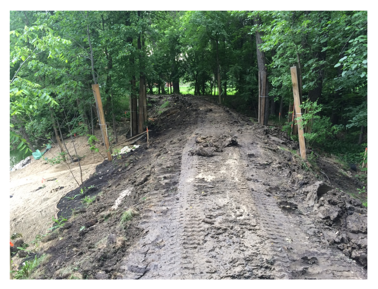
Photo 5 - Existing dike following the removal of organics at 3154 Henderson Highway.