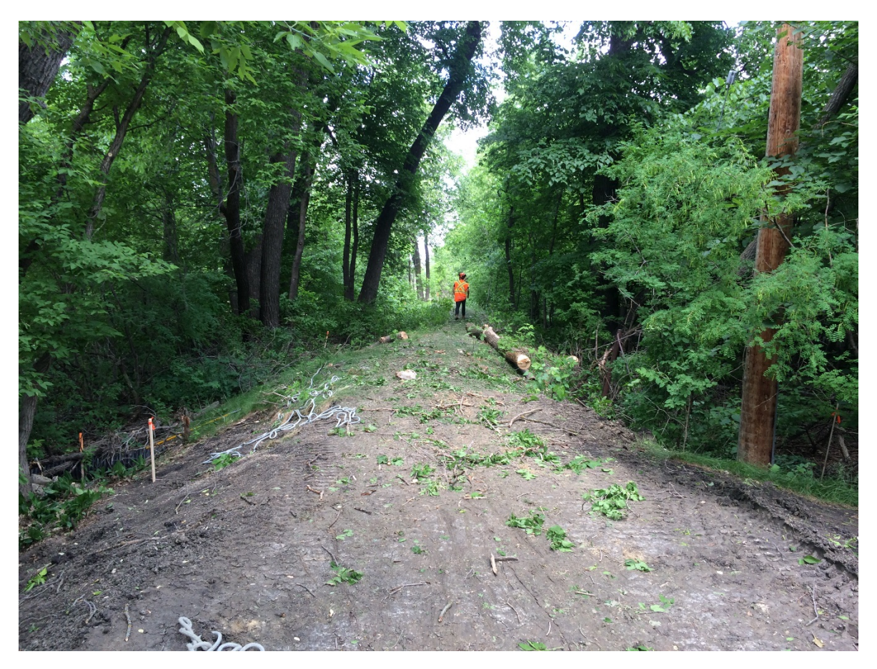
Photo 1 - Arborists pruning and removing trees at 3144 & 3154 Henderson Highway.