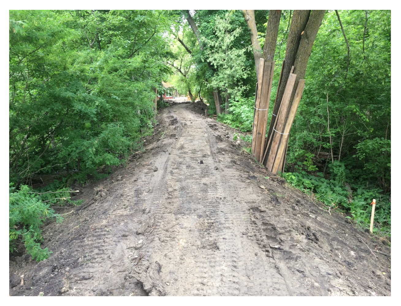
Photo 4 - Existing dike following the removal of organics at 3154 Henderson Highway, along with protected trees.