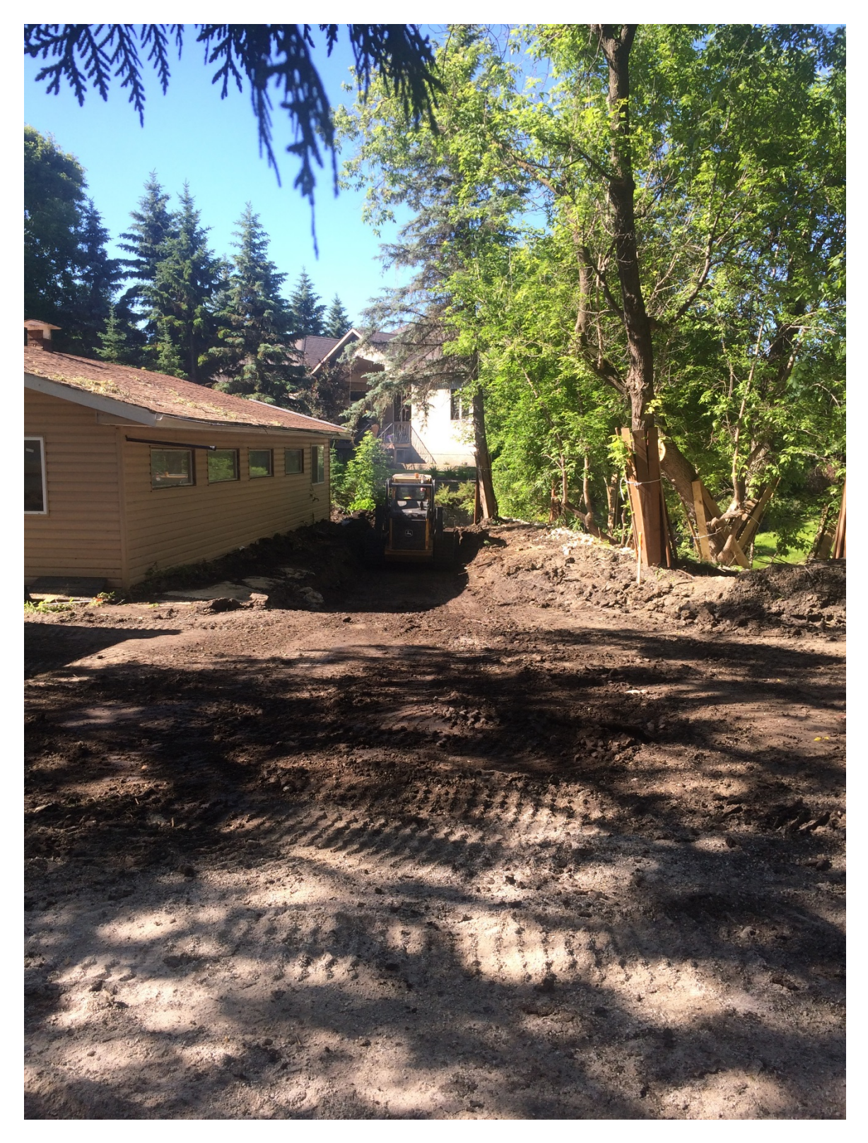
Photo 7 - Removal of organic material below existing dike at 3144 Henderson Highway.