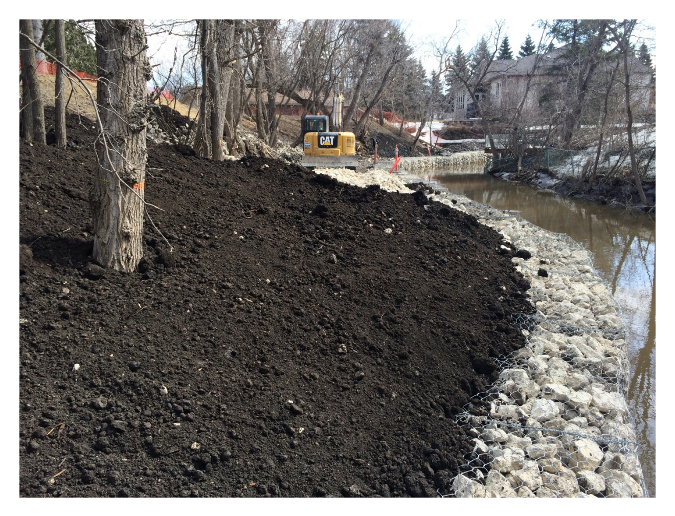
Photo 4 - Placing topsoil on rockfill toe berm at 3144 Henderson Highway.