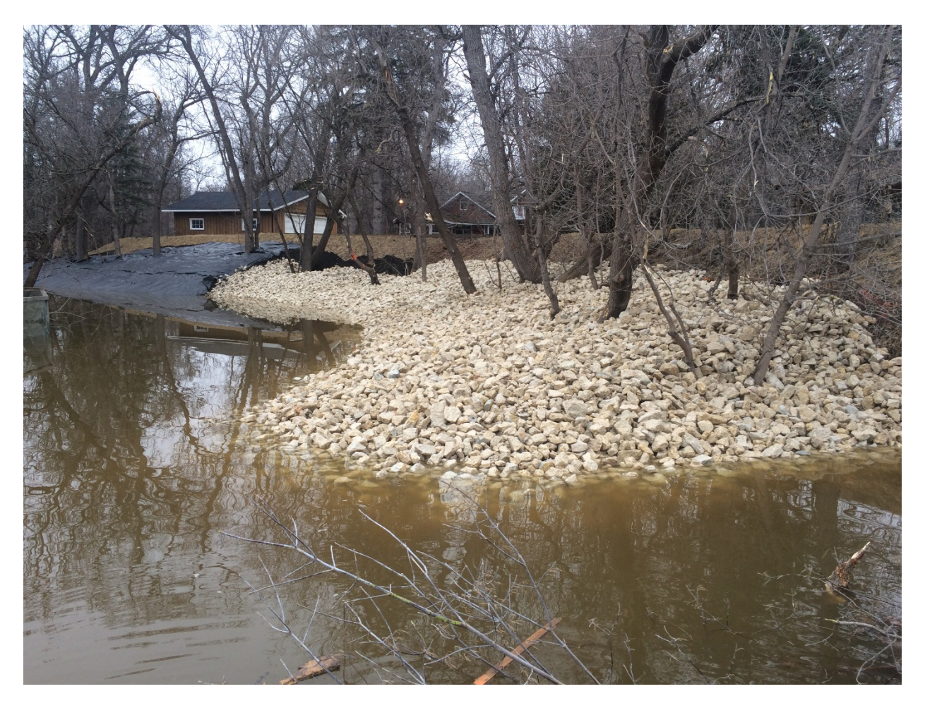
Photo 5 - Completed rockfill toe berm at 3144 Henderson Highway. Additional topsoil to be placed during Phase 2 of the project.