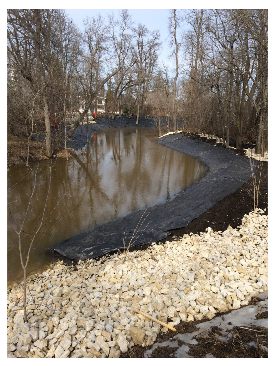
Photo 2 - Topsoil placed with geotextile on top at 3144 Henderson Highway.