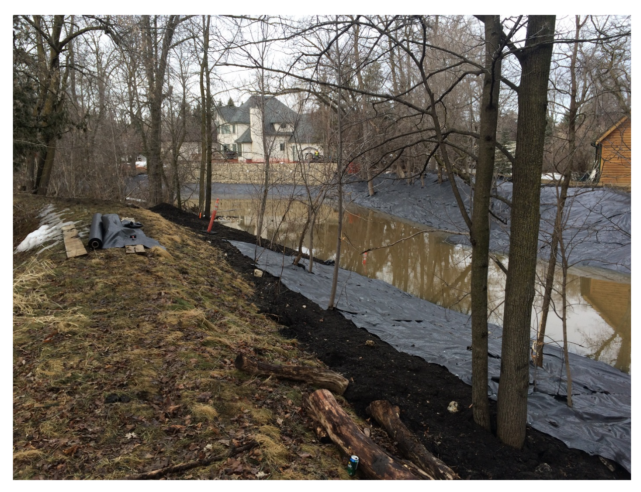
Photo 1 - Topsoil placed with geotextile being placed on top at 3154 Henderson Highway.