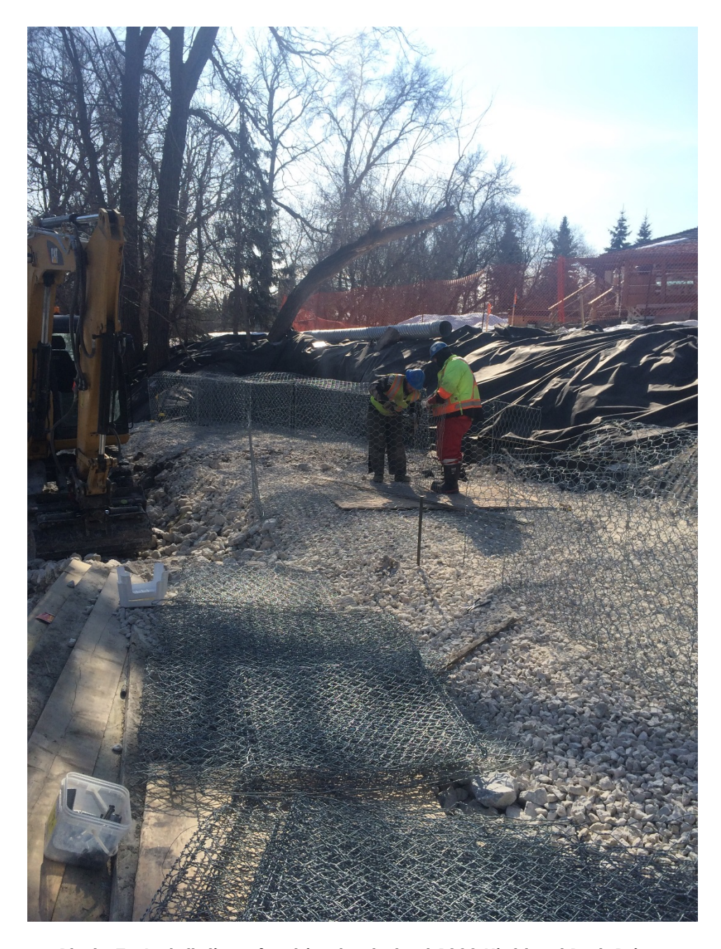
Photo 7 - Installation of gabion baskets at 1030 Highland Park Drive.