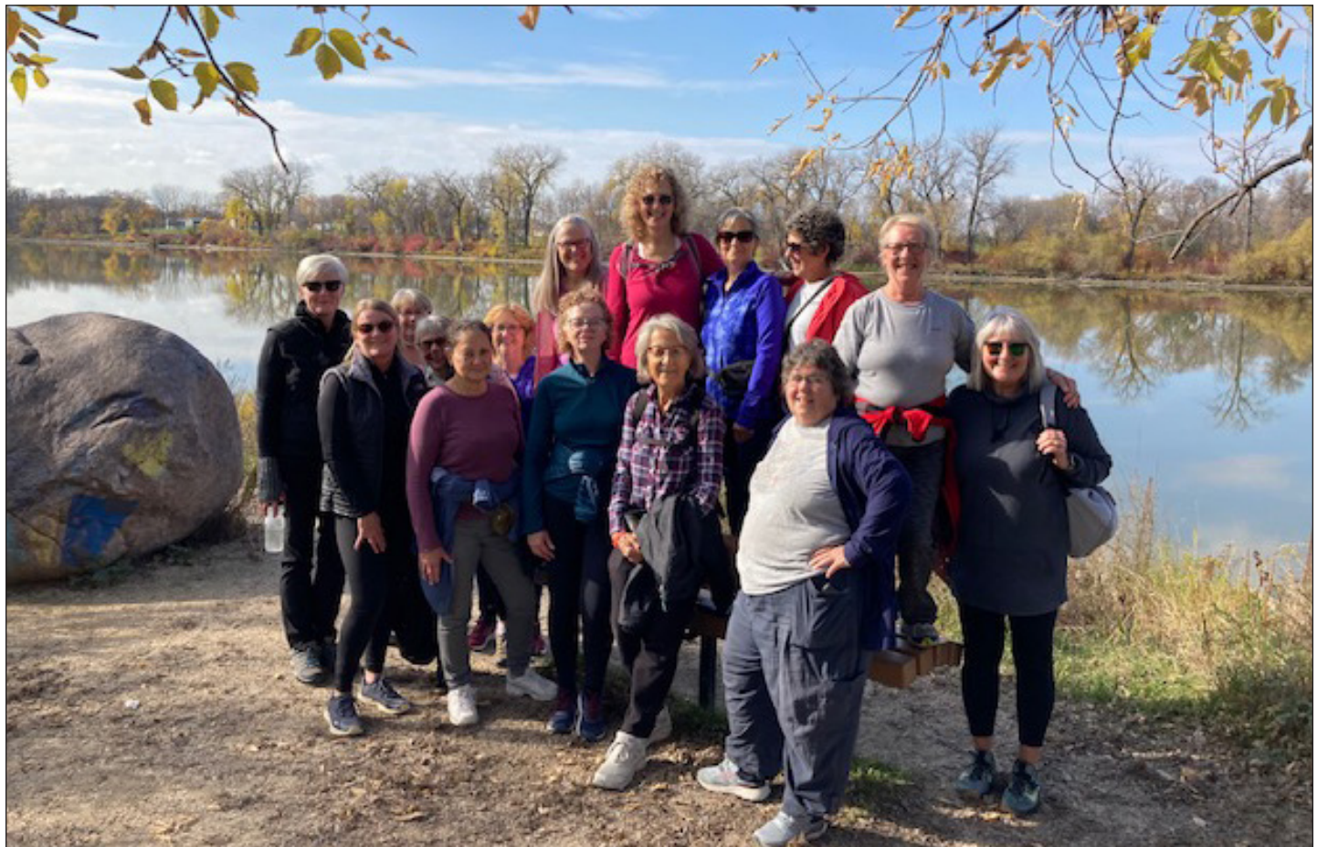
The bikers have become hikers and if the snow ever shows up they'll be cross-country skiing and snowshoeing. The group has partnered with several groups, including the RM of East St. Paul, to offer more activities.

The cycling group was born out of necessity. Gravelle-Mackenzie was a cyclist and interested in joining a group for camaraderie and safety reasons too. But she found it difficult to fit in,