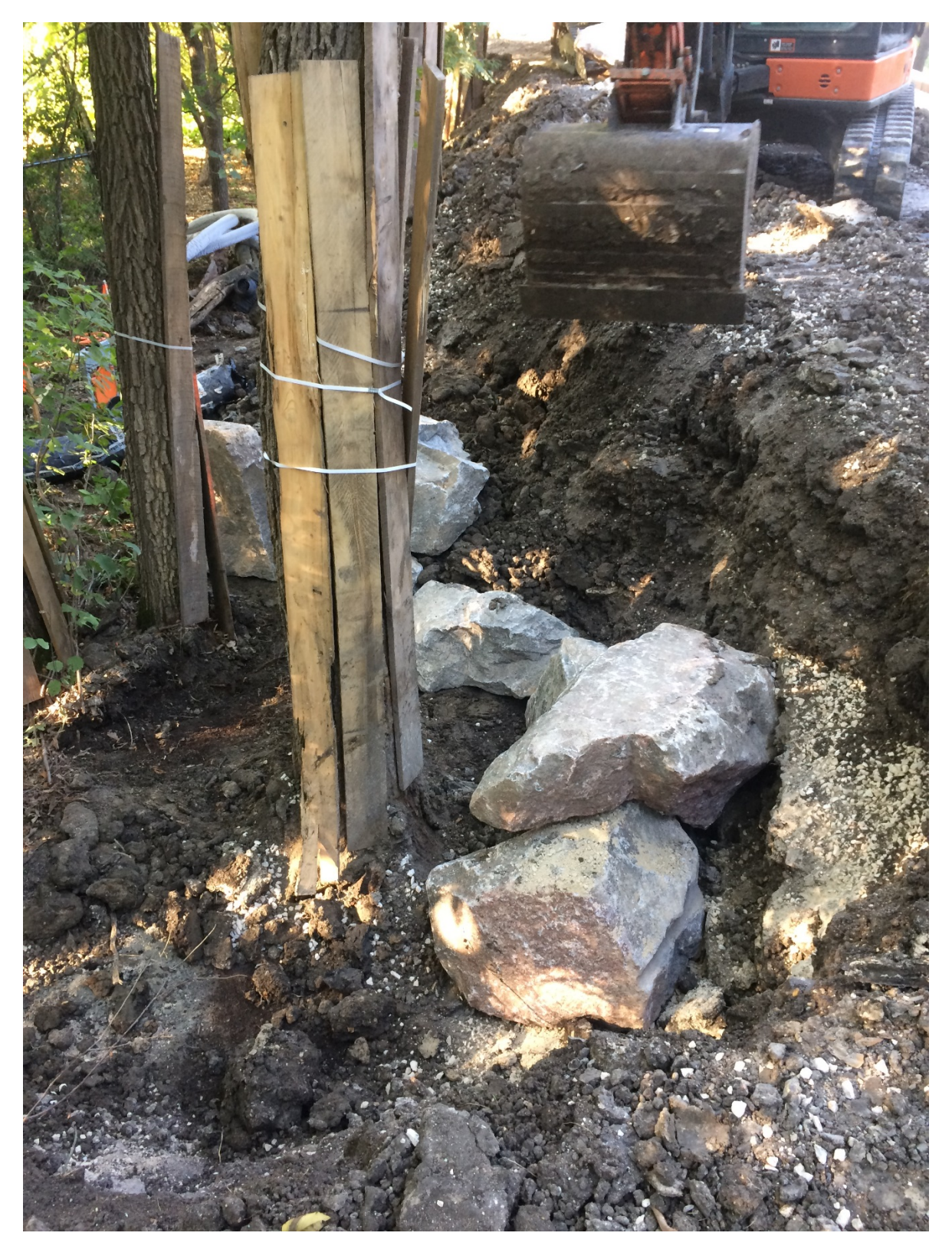
Photo 6 - Placement of clay fill for new dike and rock for tree wells at 3154 Henderson Highway.