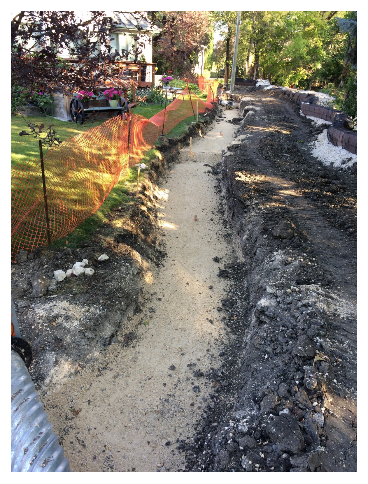
Photo 2 - Foundation for house side segmental block wall at 1030 Highland Park Drive.