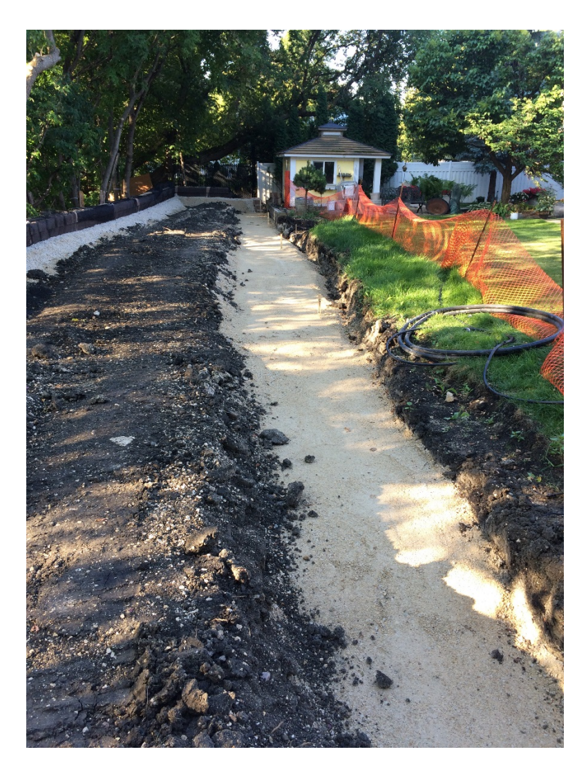
Photo 1 - Foundation for house side segmental block wall at 1020 Highland Park Drive.