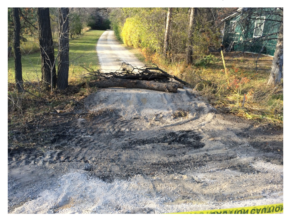
Photo 5 - Removed original driveway approach at 3144 Henderson Highway.